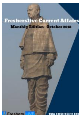
October 2018 Current Affairs