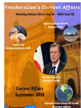
September 2018 Current Affairs