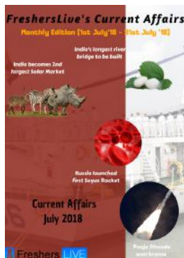
July 2018 Current Affairs