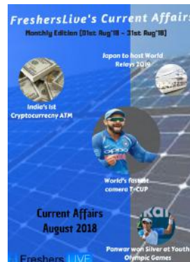
August 2018 Current Affairs