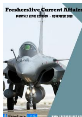
November 2018 Current Affairs