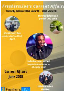
June 2018 Current Affairs