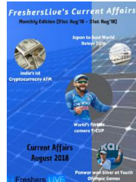
August 2018 Current Affairs