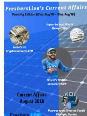
August 2018 Current Affairs