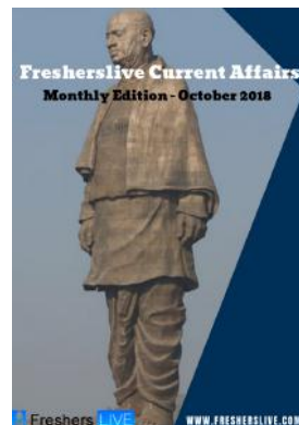
October 2018 Current Affairs