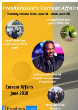
June 2018 Current Affairs