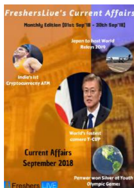
September 2018 Current Affairs