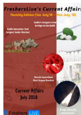
July 2018 Current Affairs