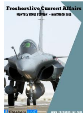
November 2018 Current Affairs